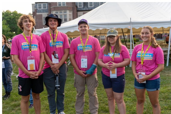
Left: Concordia Lutheran represents Nebraska at the NCF-Envirothon in Geneva, New York. The students had a great oral presentation placing 18th out of 49.

The NCF-Envirothon included 49 teams from the U.S., Canada, China and Singapore. Top places went to Tennessee (first), New York (second), and Maryland (third). The 2025 NCF-Envirothon will be hosted in Calgary, Alberta, Canada, July 20-26, 2025.