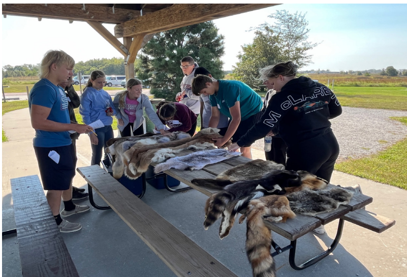
Above: Students learn how to identify wildlife pelts with Nebraska Game & Parks during the Envirothon Field Day in Wahoo on Sept. 4, 2024.