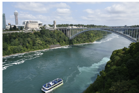
Right: The "Fun Day" during the NCF-Envirothon in New York included a day at Niagara Falls where students took the Maid of the Mist boat tour.