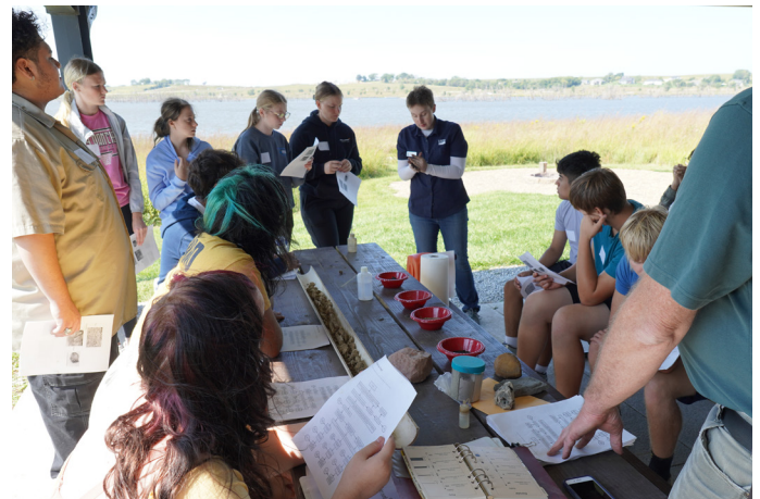
Above: NRCS Soil Scientists show students how to texture soil.