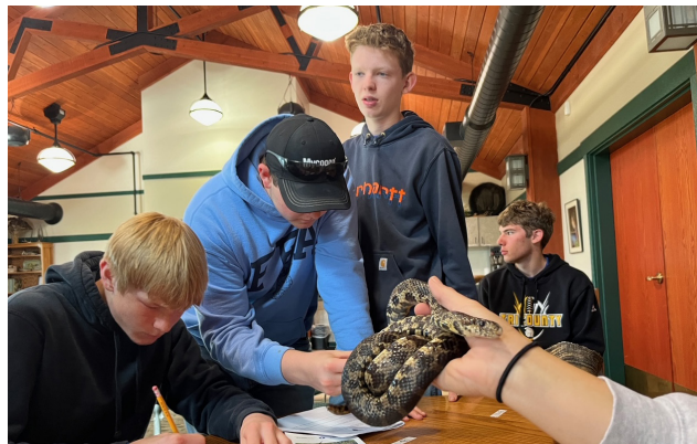
Tri-County students work to identify a snake at the Wildlife station during the State Envirothon at Ponca State Park.