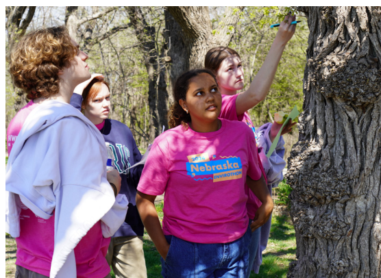
Left: Omaha Zoo Academy students identify a tree at the Forestry station.