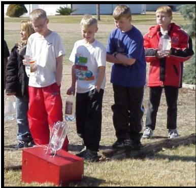
Students launching bottle rockets while learning about NRD’s

To increase awareness of natural resources the LNNRD offers sixteen scholarships to the Nebraska Range Youth Camp. The scholarships consist of paying 75% of the registration fee. Youth who are interested in rangelands and practical range management are encouraged to attend. Participants develop an awareness of the importance and value of Nebraska’s greatest renewable resource.