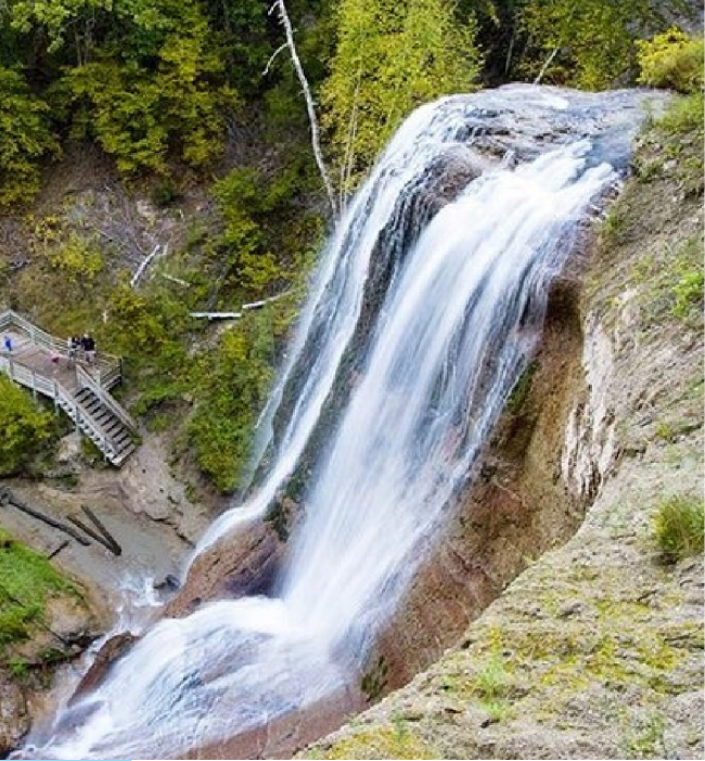
Smith Falls.

33 inches precipitation 840 feet above sea level