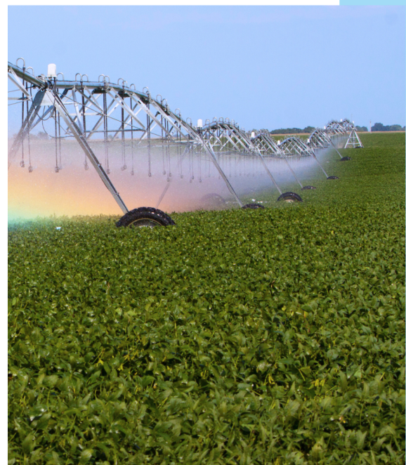
Center pivot irrigating soybeans.