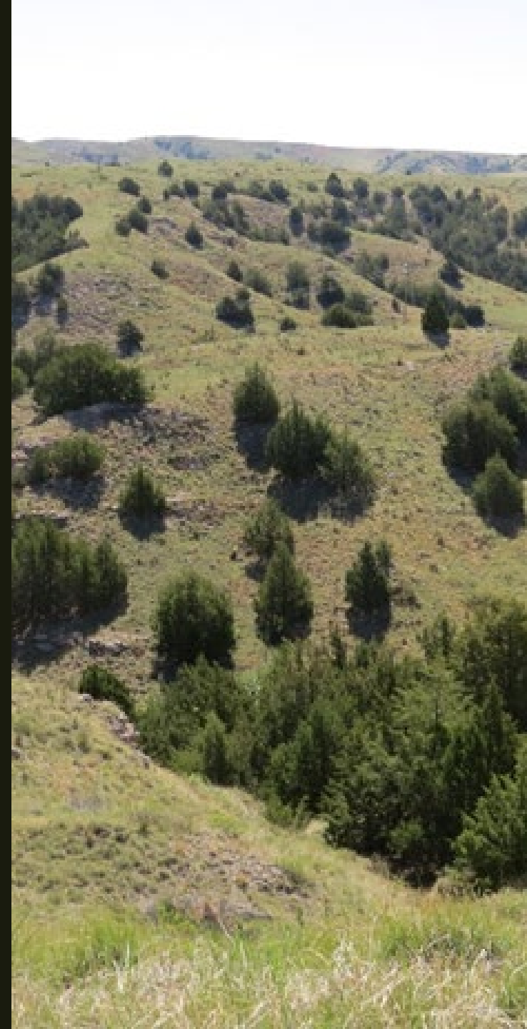
Photo: Eastern Red Cedar encroachment into grasslands near Ash Hollow State Historic Park.