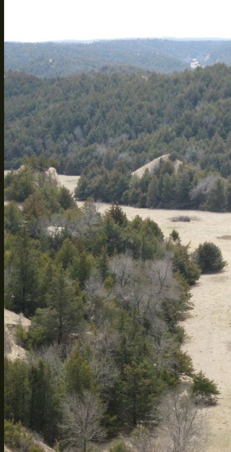
Photo: Parts of the Loess Canyons, near North Platte, have been converted to a eastern red cedar forest.