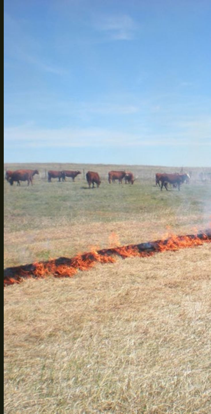
Photo: Late spring prescribed burn to reduce the amount of smooth brome grass in a native meadow in SW Nebraska.