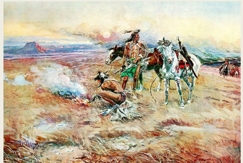
Charles M. Russell painting of Native Americans lighting fires on the Great Plains of North America