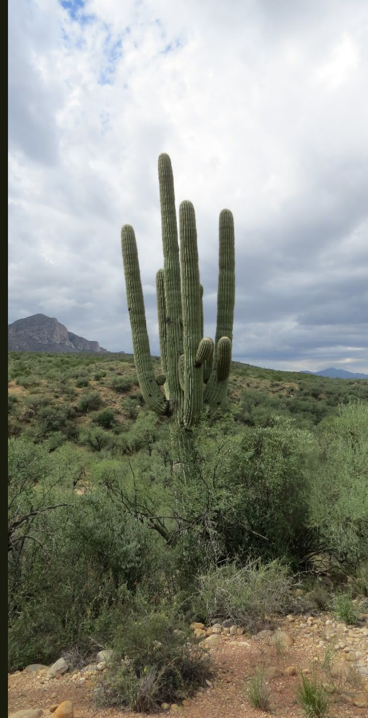
Photo: Sonoran Desert near Tucson Arizona is an ecosystem that did not develop with fire.

In Nebraska, the estimated frequency of fire was 6 - 14 years, decreasing from east to west due to the decrease in biomass production.