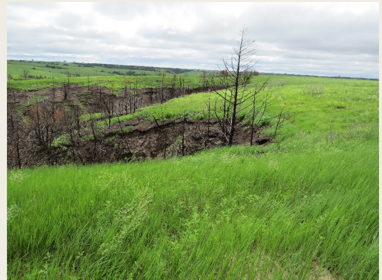
Photo: Mixed grass Prairie approximately 2 months after a spring prescribed burn.