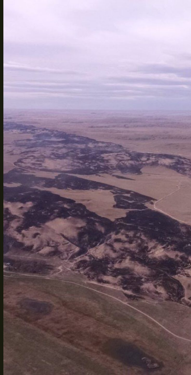
Photo: Late winter wildfire near Ogallala, NE