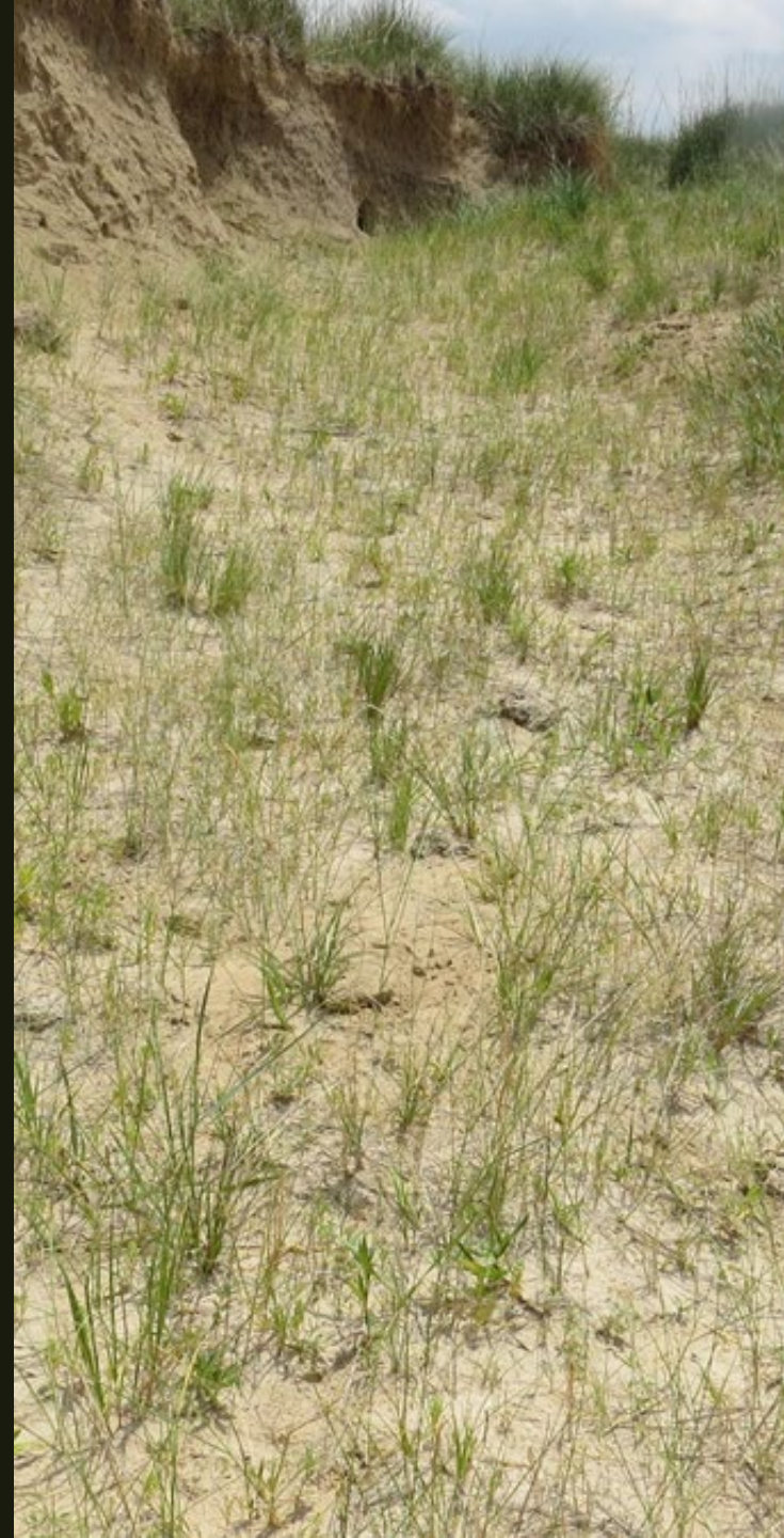
Photo: Blowout which is beginning to become stabilized by presence of blowout grass and forbs.

Wind scoured areas, blowouts and depositional areas apply to soil/site stability.