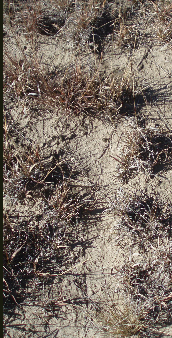
Photo: Mixed grass prairie that has been grazed intensively leaving very little plant material and virtually no litter.

Litter amount applies to hydrologic function and biotic integrity.