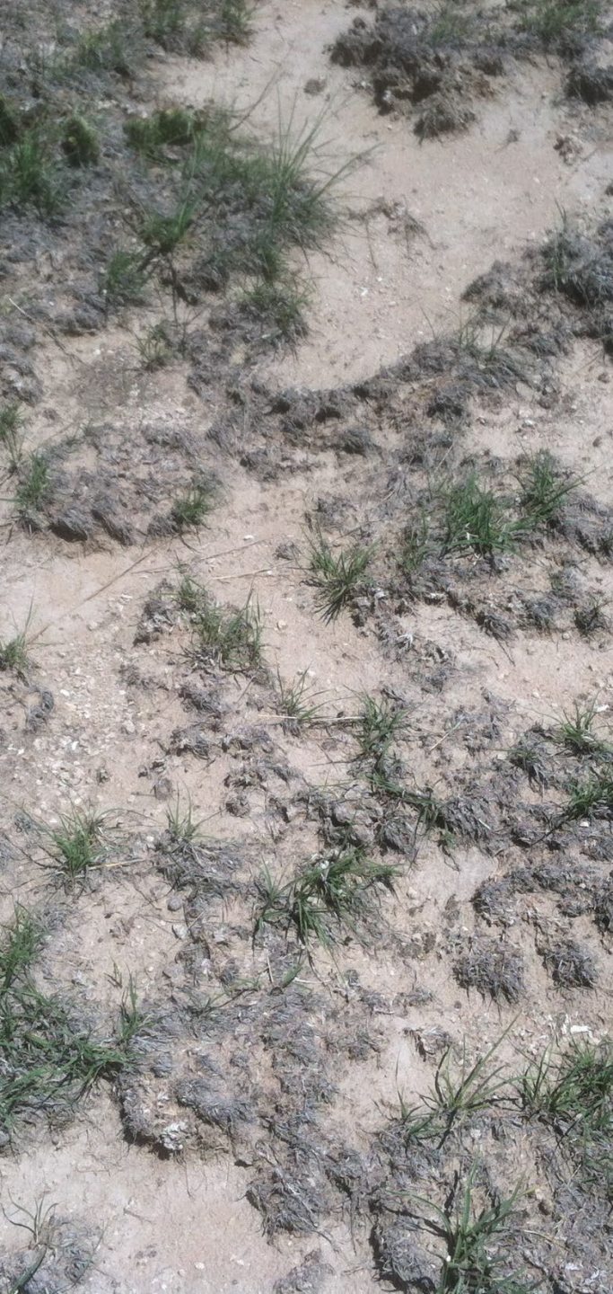
Photo: Blue grama/buffalograss plant community after 2012 drought showing extensive death loss.

Plant mortality/decadence applies to biotic integrity.