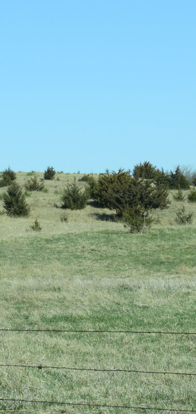
Photo: Eastern Red Cedar encroachment in loamy upland rangeland.