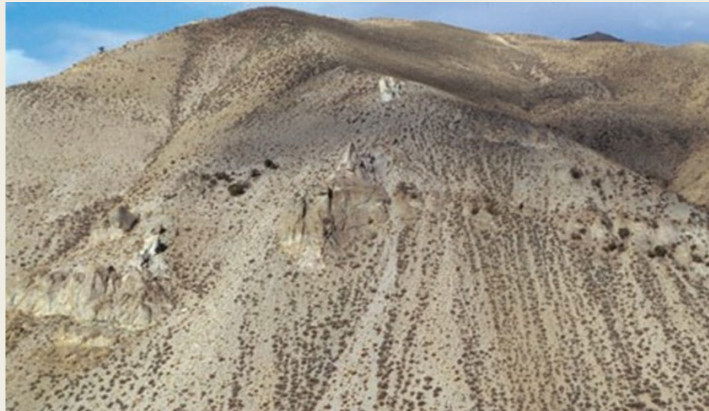
Photo: Badlands site on which rills are part of the Reference State

Rills apply to soil/site stability and hydrologic function.