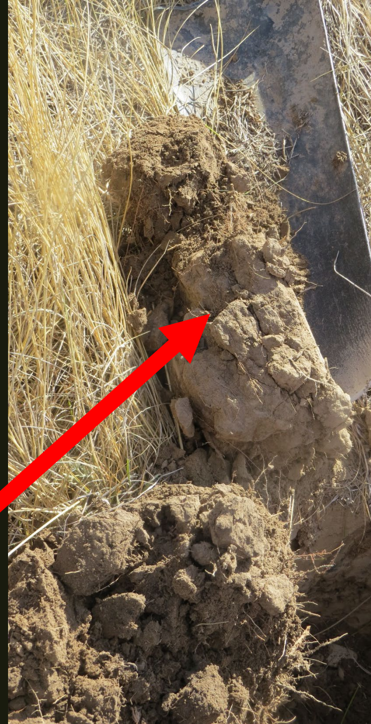
Photo: Soil with a compaction layer approximately 4" from the soil surface. A compaction layer is indicated by a horizontal break in the soil profile and a sharp difference in soil texture.

Compaction layer applies to soil/site stability, hydrologic function and biotic integrity.