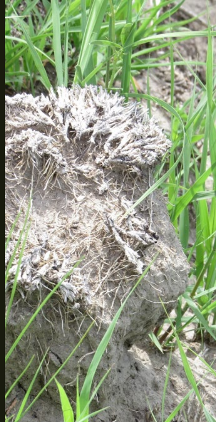
Photo: Pedestalled plant found in a steep hillside that had recently been burned in a prescribed fire.

Pedestals and terracettes apply to soil/site stability and hydrologic function.