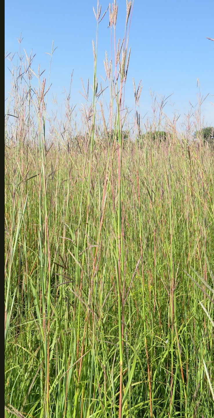
Photo: Big bluestem exhibiting high productivity.

Annual production applies to biotic integrity.