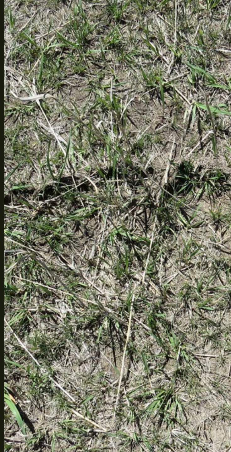
Photo: There is a small amount of litter accumulation near the middle of this photo.

Litter movement applies to soil/site stability.