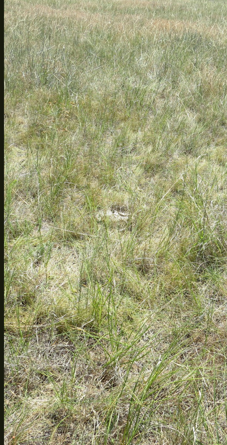
Photo: Plant community which has changed from the reference plant community. Warm season tall and mid-grasses that would be in the reference state are not present.

Plant Community Composition applies to soil/site stability, hydrologic function and biotic integrity.