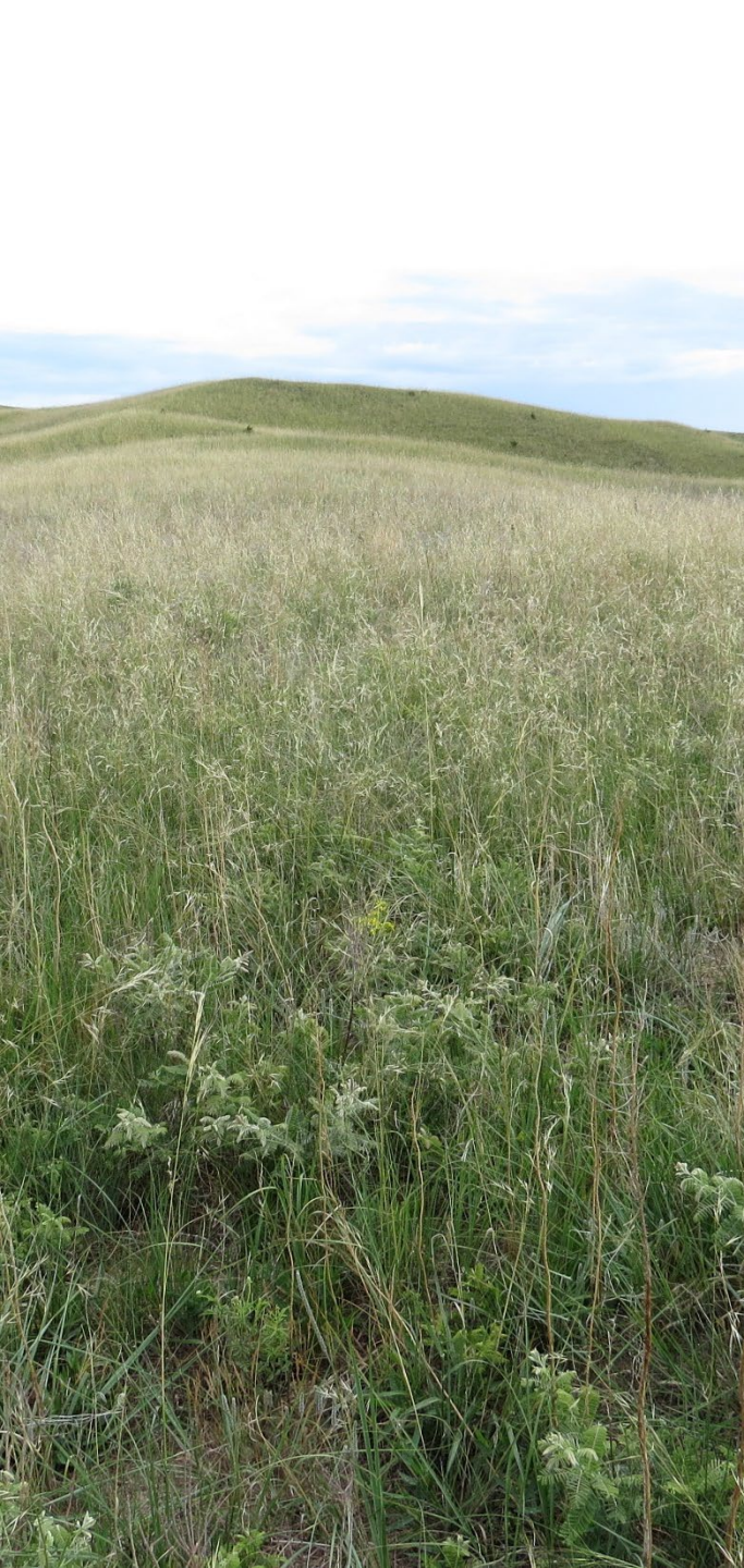
Photo: Sands Ecological site in reference state.

The expected condition for these indicators varies from ecological site to ecological site.