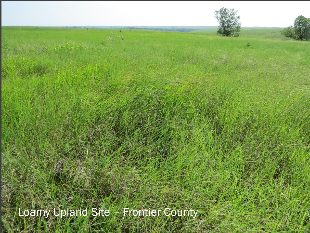
Loamy Upland Site – Frontier County