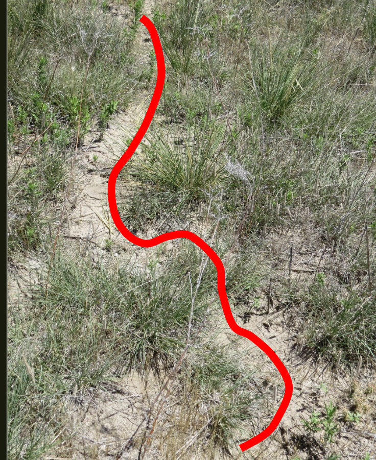
Photo: Water flow pattern in a bunchgrass dominated site.

Water flow patterns apply to soil/site stability and hydrologic function.